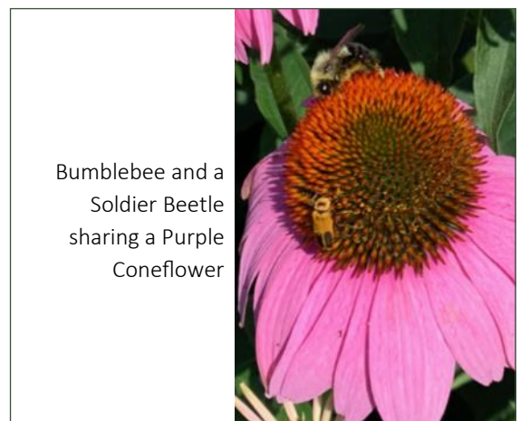
Bumblebee and a Soldier Beetle sharing a Purple Coneflower