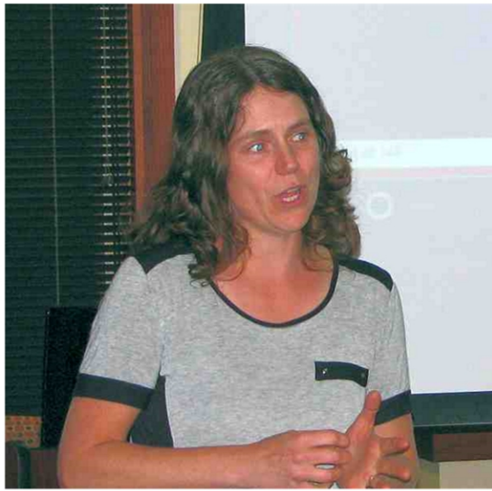
Photos from the Wildflower Walk and last month's meeting.