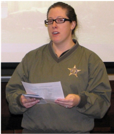
AH Police Rep discussing medication disposal